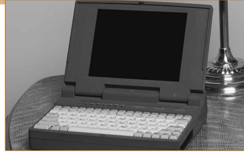
Bidders' Need for Information

There have been papers and articles presented and written about the benefits of aggregating the lease purchase needs of a district and bidding that as one stand-alone bid a year. The benefits are the savings generated. Our objective is to demonstrate how the use of a common bidding site on the Internet can further optimize the tax dollars in connection with the lease purchase.